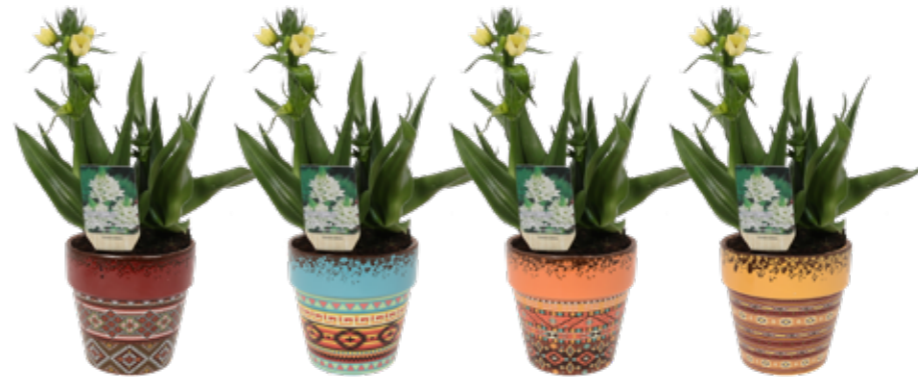
14 TA614113WT Nairobi