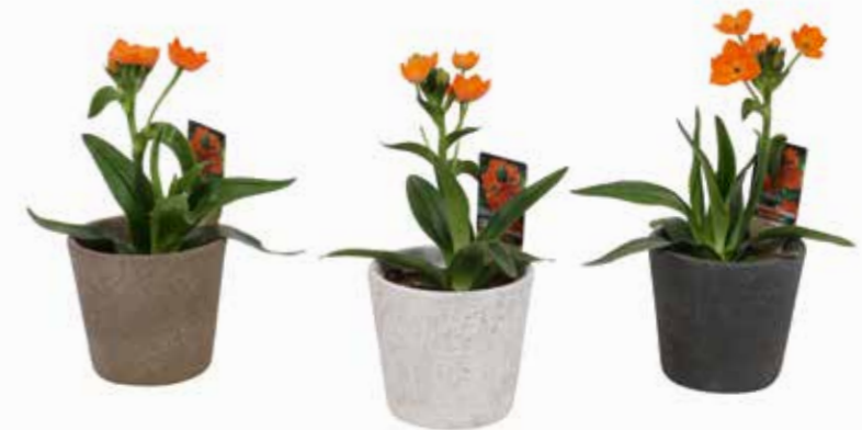
10,5 TL612101 Luna