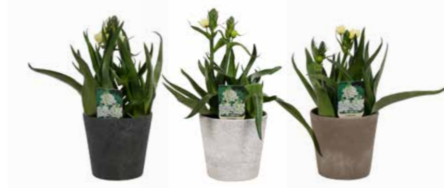
13 TL613725 Luna