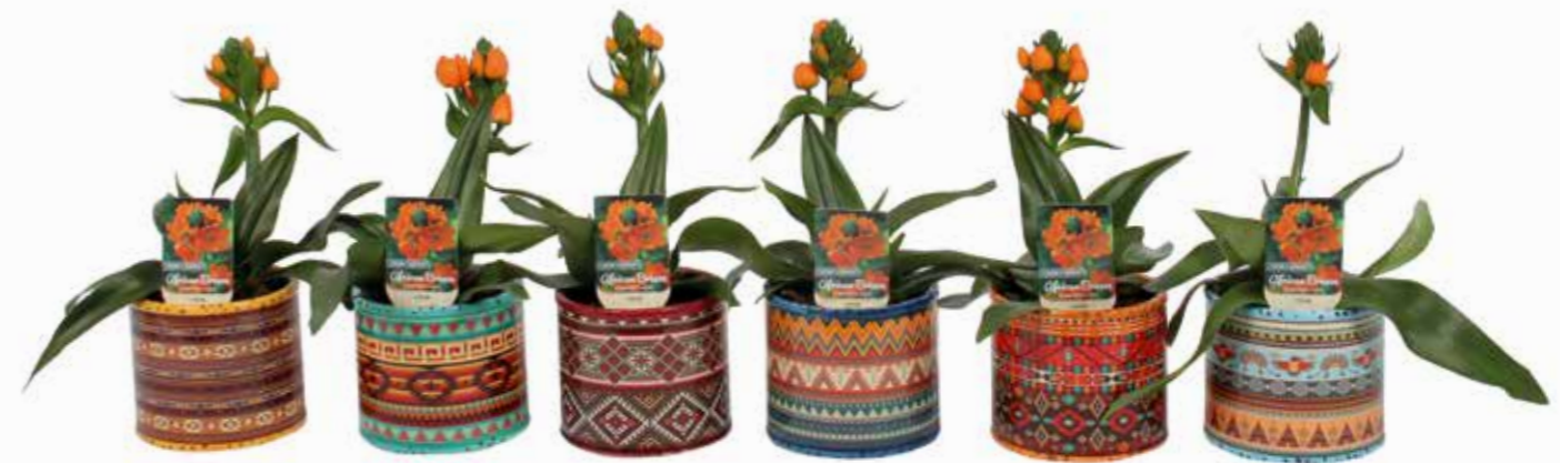
10,5 TL612100 Africa

The dubium only grows in nature in the Cape Province in South Africa (Table Mountain on the South Cape).