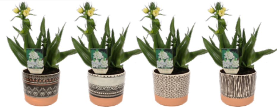
14 TA614114WT Kenya